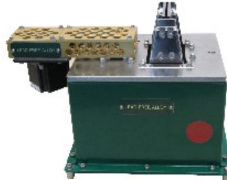
"The soldering process"