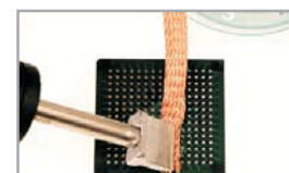
Step 1 Wick BGA and Clean with Alcohol