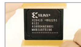
Step 4 Align BGA with EZReball preform