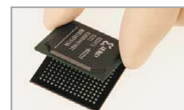
Step 3 Place BGA on top of EZReball preform