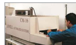
Step 5 Reflow BGA using your own profile