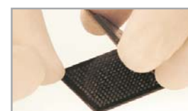
Step 6 Remove EZReball from BGA