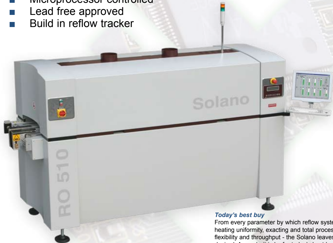
Photo: Solano with optional monitor and keyboard