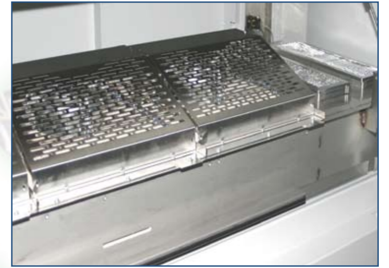
Photo: Heating cell with cooling zone

This is achieved with Solano circulating air speed of 1 to 1.3 meters per second. (Any faster could endanger chips from being misaligned or shifted.) However, many systems move the air at a much slower rate in some instances causing a substantial temperature imbalance between components and the air surrounding them. Faster air speeds are also ideal for densely populated and multi-layer boards, as well as in all other critical soldering applications like lead free soldering. For ease of service the heating cells can be removed from the top without dismantling the process chamber.