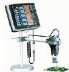
Video Inspection System Flexia C1 ESD Item No. OP-019 022