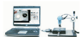
Flexia Vision XY-Measuring System, ESD-protected Item No. OP-019 155